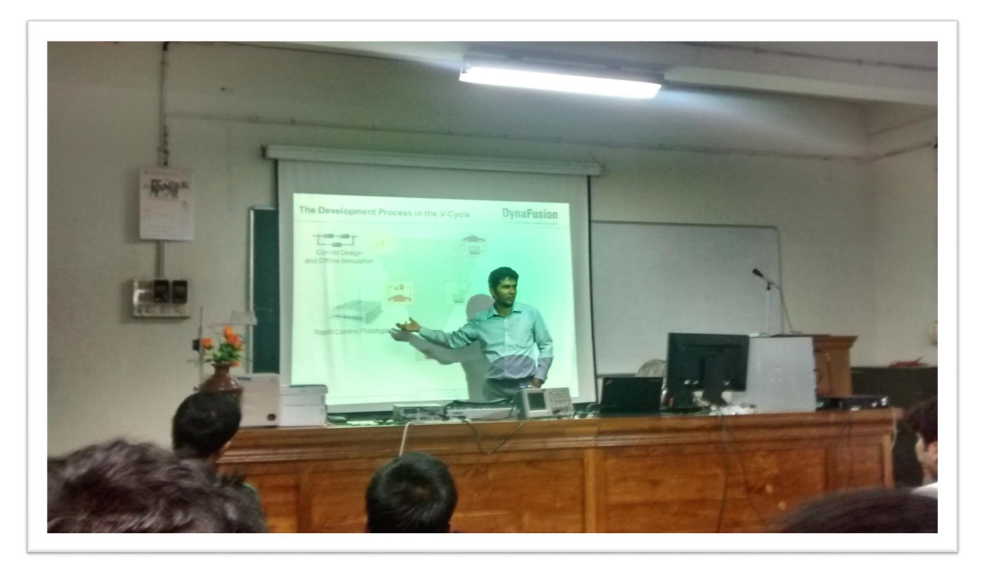
Control Design Development Cycle demonstrated by DynaFusion