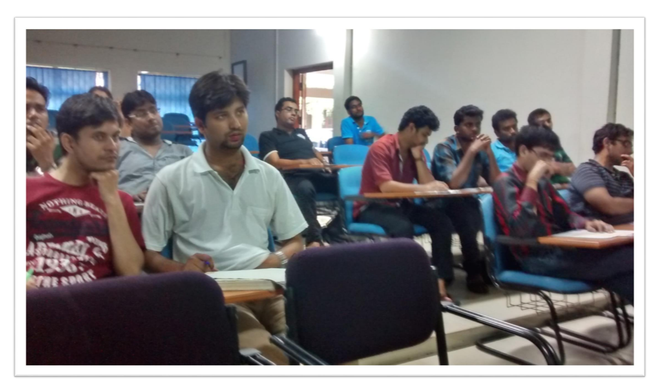
Participants during the training session