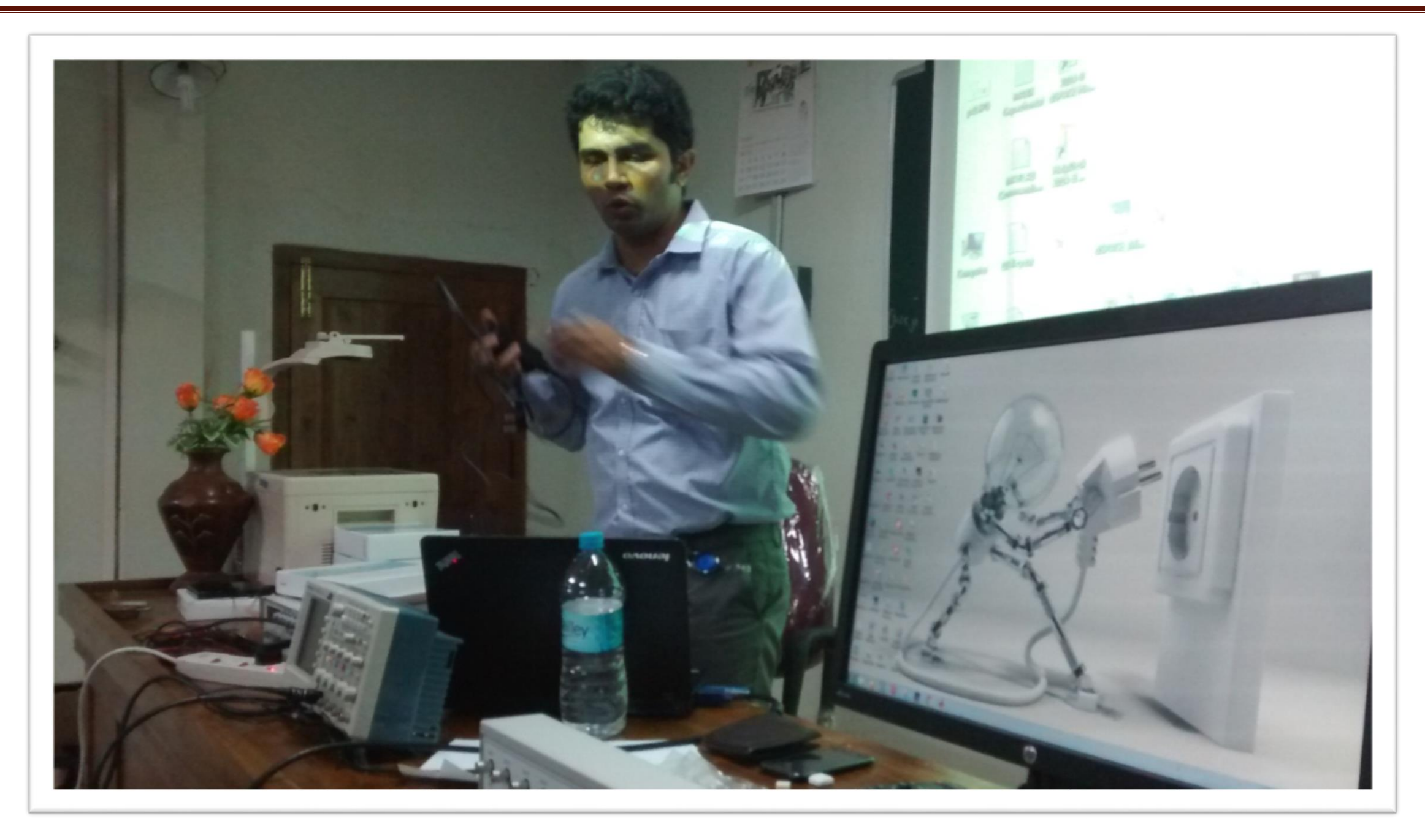
Demonstration of the hardware modules used in dSPACE