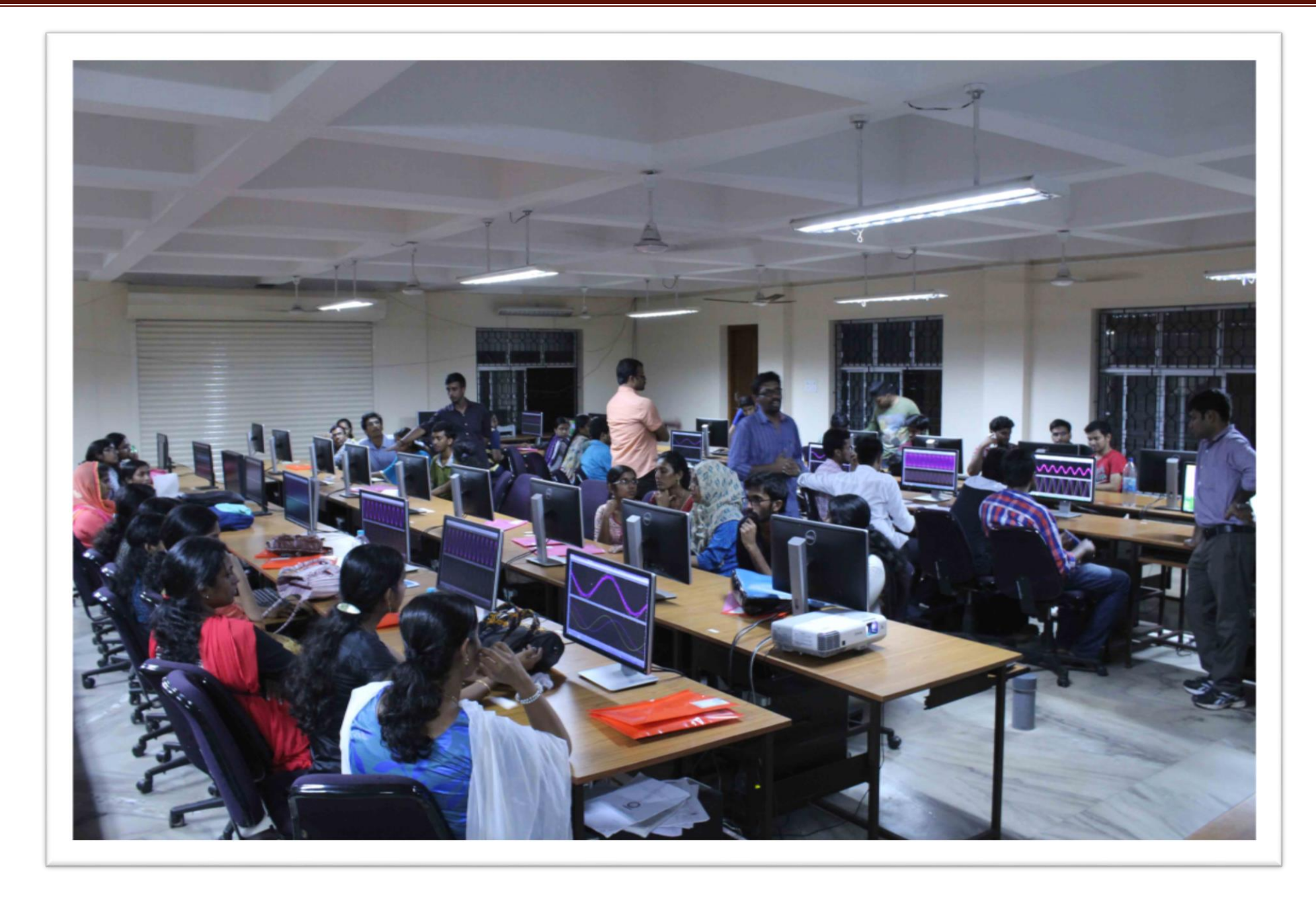
Participants attending lab session