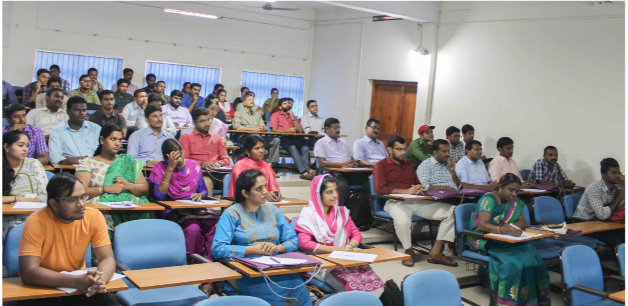
Participants during the session