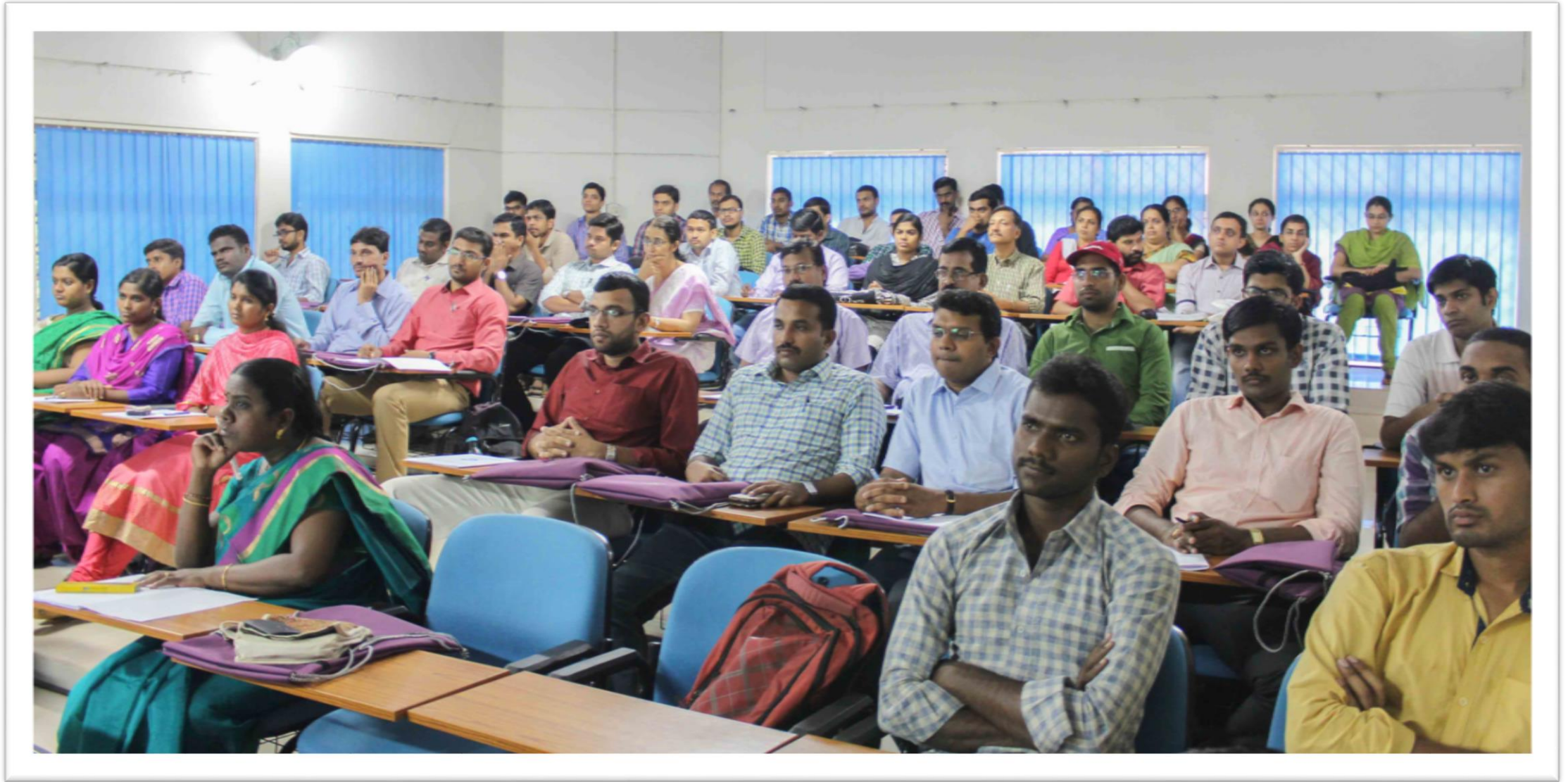
Participants during the session